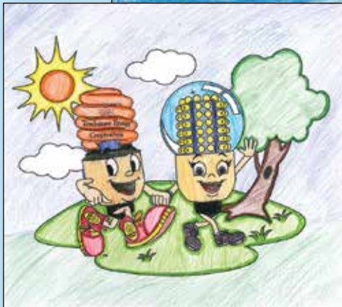
Kadinse 9 & over

Thanks to 200+ youth for entering our first Annual Coloring Contest!