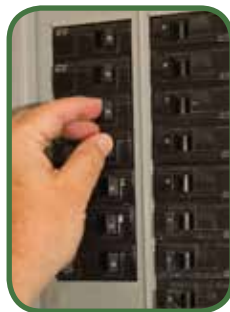
Make sure your spring cleaning routine includes checking your circuit breaker box.