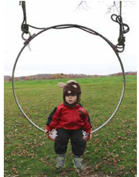
Guests are also welcome to explore the farm, and even take a turn on the unique hoop swing fitted with a tractor seat.